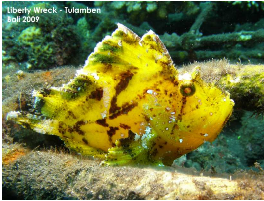
Liberty Wreck - Tulamben Bali 2009